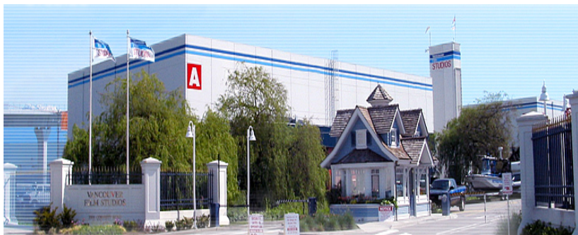
Vancouver Film Studios, British Columbia

Vancouver Film Studios decided to deploy a Cisco IP Communications solution in 2001 when its private branch exchange (PBX) phone system had reached capacity. Rather than spend money to upgrade its entire system, the studios decided to invest in new, expandable technology that would accommodate growth and a variety of needs. Now, nearly the entire film studio is on Cisco IP Communications.